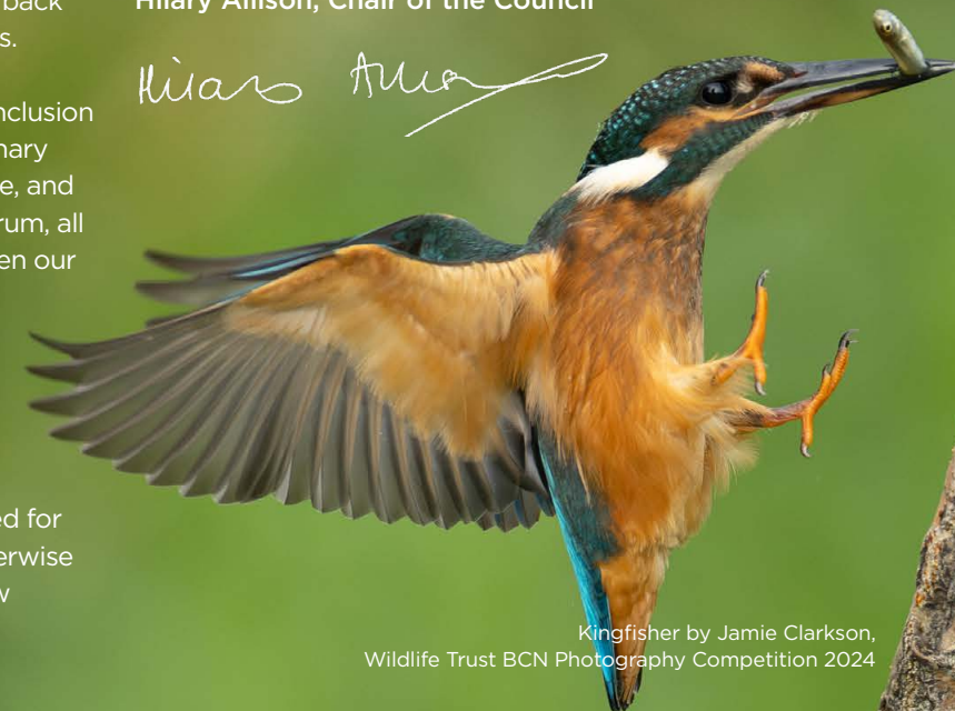
Kingfisher by Jamie Clarkson, Wildlife Trust BCN Photography Competition 2024