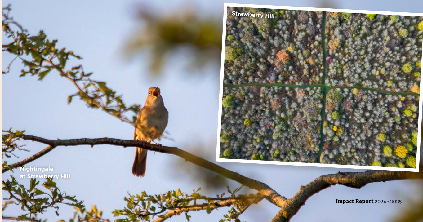
Nightingale at Strawberry Hill

In November we completed the purchase, saving the site for nature, forever. We are continuing to survey and record the species there while developing a plan to protect the habitat and ensure the public can visit and enjoy this special place.