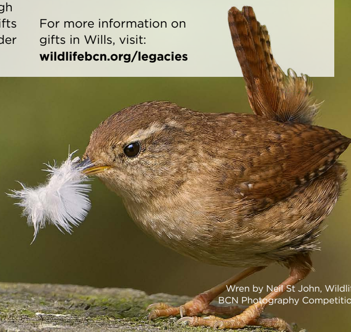
Wren, Wildlife Trust BCN Photography Competition 2024

For more information on gifts in Wills, visit: wildlifebcn.org/legacies