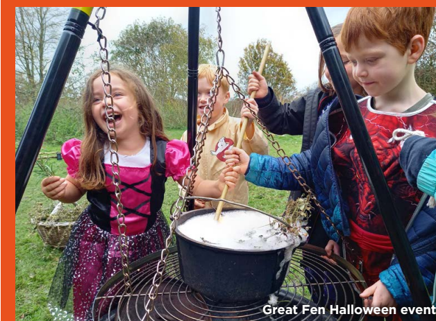
Great Fen Halloween event