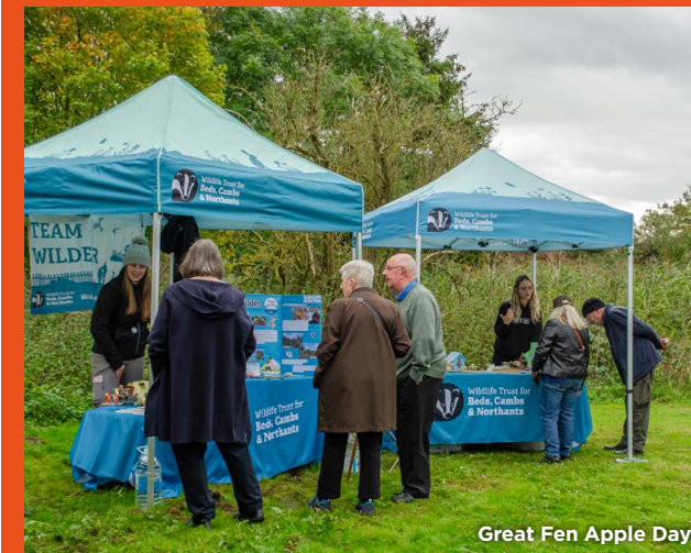
Great Fen Apple Day