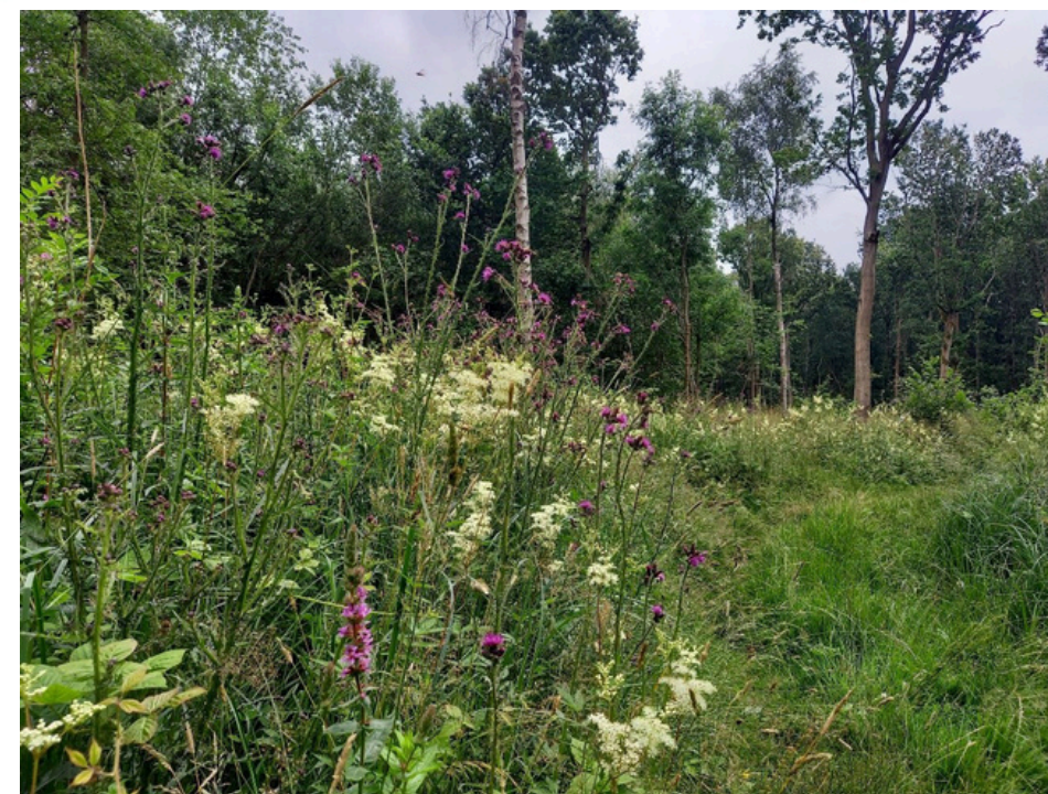
An open, sunny ride - better for wildflowers and insects