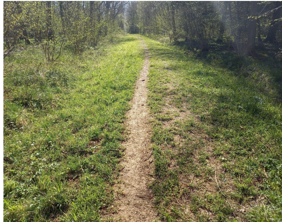
A ride with a decent camber - better for preventing muddy conditions