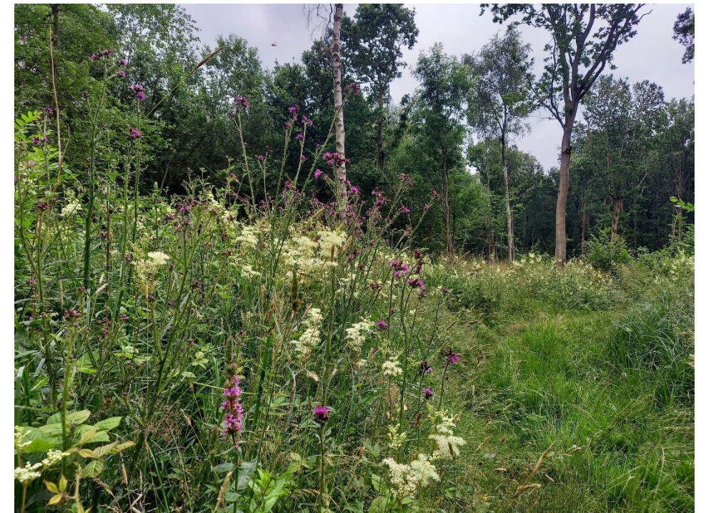
An open, sunny ride - better for wildflowers and insects