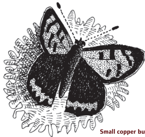
Small copper butterfly