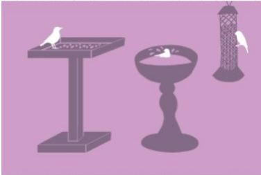
How to feed birds in your garden