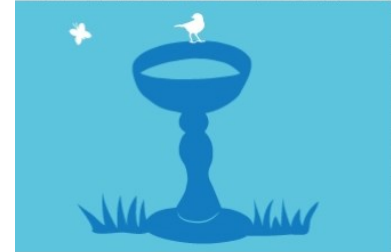
How to provide water for wildlife