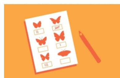
How to take part in a citizen survey