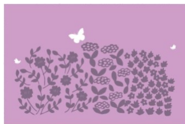
How to make a hedge for wildlife