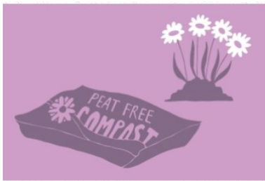
How to go peat free