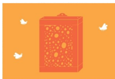
How to make a bee hotel