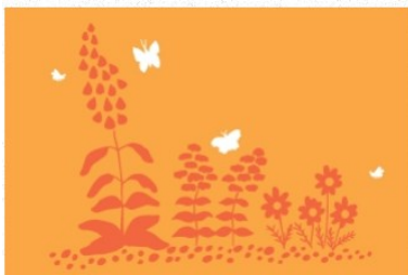
How to make a gravel garden for wildlife

Think of new ways you could grow and expand your wildlife garden, share your ideas with other organisations within your network and perhaps even with your customers. The more people we have participating in wildlife friendly gardening, the better it will be for all! More ideas below: