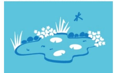
How to build a pond