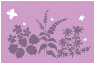
Plant flowers for bees and pollinators

Click on the pictures below for more information on our Wildlife Trust BCN website: