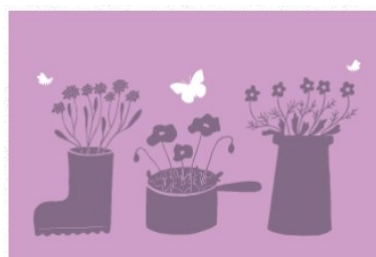
How to create a container garden for wildlife

You can find lots more ideas for your Wildlife at Work Gardening at Work Award entry see www.wildlifebcn.org/actions