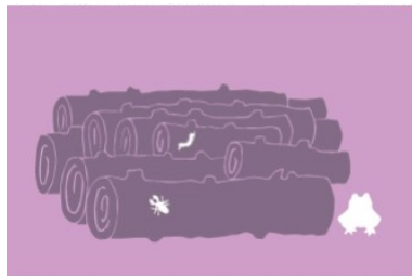
How to make a log shelter