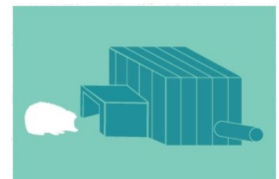
How to build a hedgehog home

Check out our ideas list (see Appendix 1 ) for suggestions on how to recycle unwanted items to create a wildlife habitat - making your wildlife garden even greener.