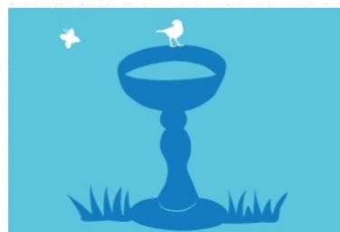
How to provide water for wildlife