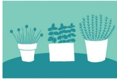
How to create a herb garden for wildlife