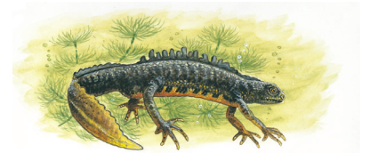
Great crested newt

The lakes in Cambourne were created to collect excess water from the town during heavy rain to prevent flooding, but they also provide a great place for lots of wildlife, especially birds such as coot. If you visit in the early morning you may be lucky and see a kingfisher, heron or cormorant fishing.