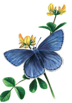
Common blue on bird's-foot trefoil

Look out for bright yellow bird's-foot trefoil and the purple thistle-like flowers of common knapweed, amongst many other wildflowers. These flowers provide nectar for butterflies such as meadow brown and common blue.