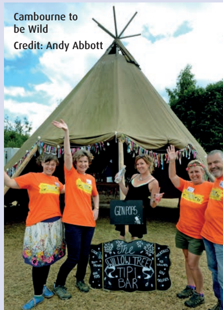
Cambourne to be Wild

Go Wild – this year the festival is part of The Wildlife Trusts' nationwide celebration of nature called the Big Wild Weekend where all over the UK there are events taking place to raise awareness of wildlife. We're sure our festival will be one of the highlights with a big mix of nature themed activities including talks and guided walks. Coinciding with the longest day of the year, this is the perfect opportunity to go wild!