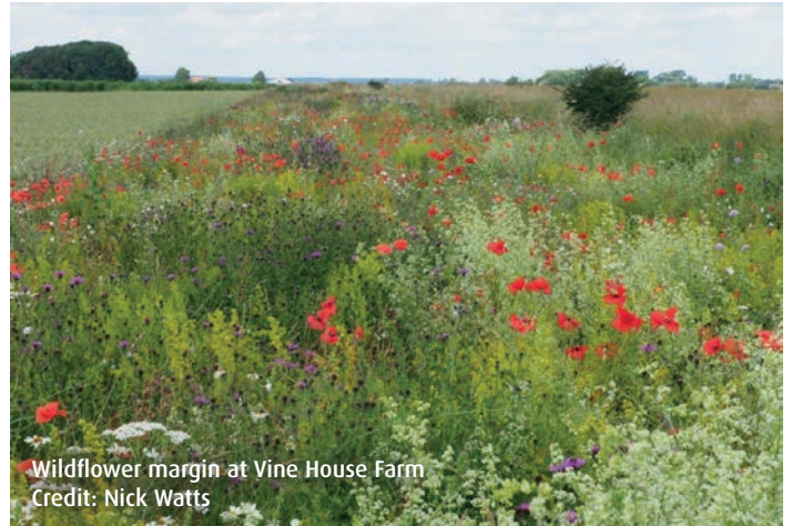
Wildflower margin at Vine House Farm