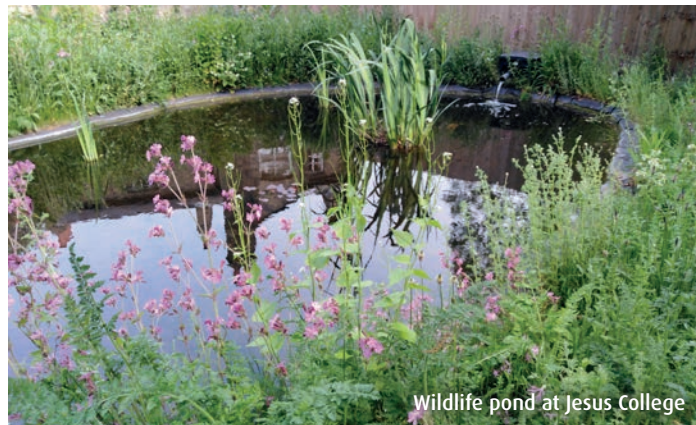
Wildlife pond at Jesus College

You can enter all or just one of the categories.