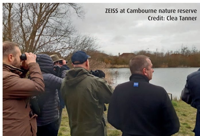
ZEISS at Cambourne nature reserve