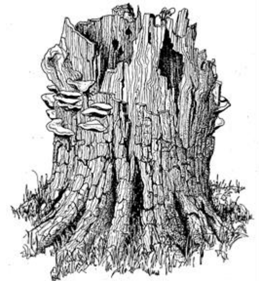
ROTTEN STUMP (full of life)