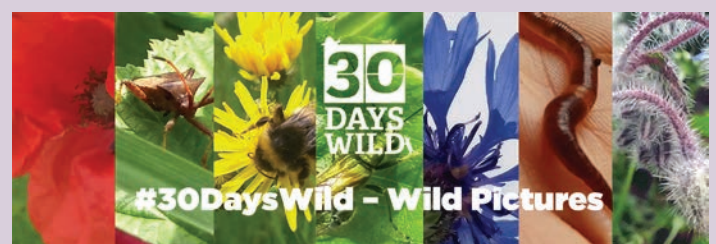
#30DaysWild - Wild Pictures

wearing something green on dress down Friday. We provided some extra resources this year to help businesses plan their Acts of Wildness. Did your company take part? We'd love to hear from you at 30DaysWild@wildlifebcn.org