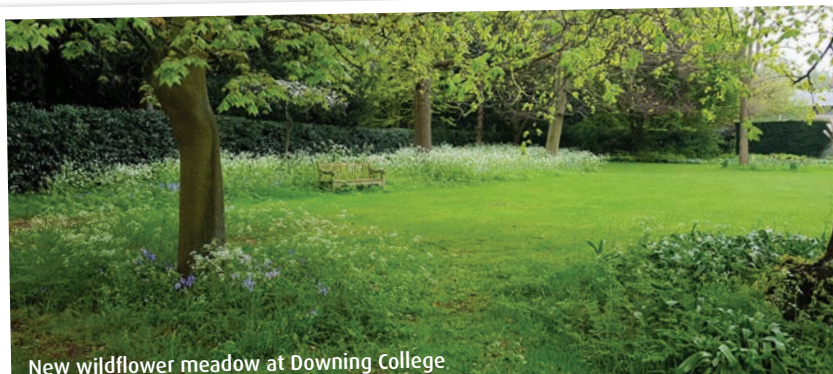
New wildflower meadow at Downing College