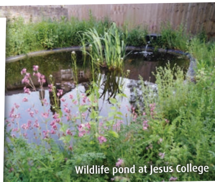
Wildlife pond at Jesus College

Downing College won the category of Best Use of Recycled Materials for Wildlife at Work . Their beautifully crafted bug hotel perfectly shows that objects can not only be given a new lease of life, but can also be incredibly useful. The attractive structure would complement any outdoor space and will no doubt support a wide variety of insects.