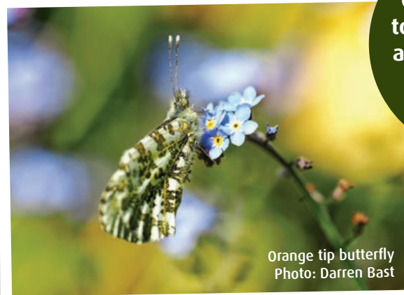
Orange tip butterfly

Congratulations to all the winners and thank you to everyone who entered.