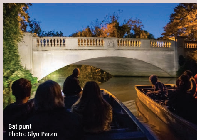
Bat punt

We recently enjoyed meeting some of our corporate members for networking and drinks at the Gonville Hotel before heading off for a bat safari with Scudamore's and our Wildlife Trust bat experts. Fortunately the rain held off as we drifted along the River Cam. At first, the bats (Common and Soprano Pipistrelle) flew close to the riverbank vegetation but gradually we were able to see them as well as 'detect' their frequencies using bat detectors. As we headed nearer to the meadows of Grantchester, we turned our dials down to hear the lower frequencies of the Noctule bat, and also glimpsed Daubenton's hunting along the surface of the river. As we headed back into Cambridge we were lucky to see the slightly rarer Serotine bat, which sounds rather like someone clapping randomly. It was fantastic to see everyone who attended, and we'll be running other events to meet members in the near future.