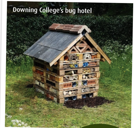
Downing College's bug hotel

Downing College won the category of Best Use of Recycled Materials for Wildlife at Work . Their beautifully crafted bug hotel perfectly shows that objects can not only be given a new lease of life, but can also be incredibly useful. The attractive structure would complement any outdoor space and will no doubt support a wide variety of insects.