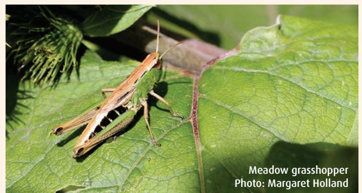
Meadow grasshopper

partners, and wider community to become signatories of the Declaration, and to consider how they too – from whatever position they occupy – can lower their impacts on forests and biodiversity, and become champions for forest and biodiversity protection.