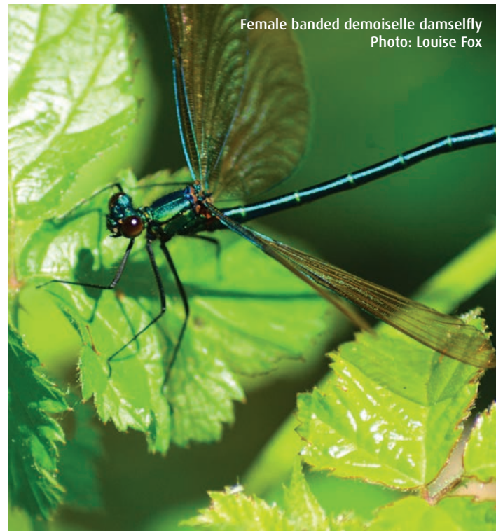
Female banded demoiselle damselfly

For the first time in my career, we are beginning to see a fundamental shift in how the natural environment is perceived and valued. The recent publication of the Government’s Our Green Future: A 25 Year Plan to Improve the Environment sets a framework for all of us in the sector to make a real difference.