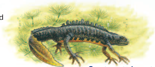
Great crested newt

The reedbeds and pools are home to many different animals, including water stick insects and some uncommon types of water beetle. Dragonflies and damselflies, such as banded demoiselle, emerge from the water in spring and summer to feed and breed along the water's edge. Great crested newts hibernate in the long vegetation on either side of the boardwalk, and in early spring, they make their way back to the pools to breed. Birds, such as reed buntings and sedge warblers, make their homes among the reed stems.