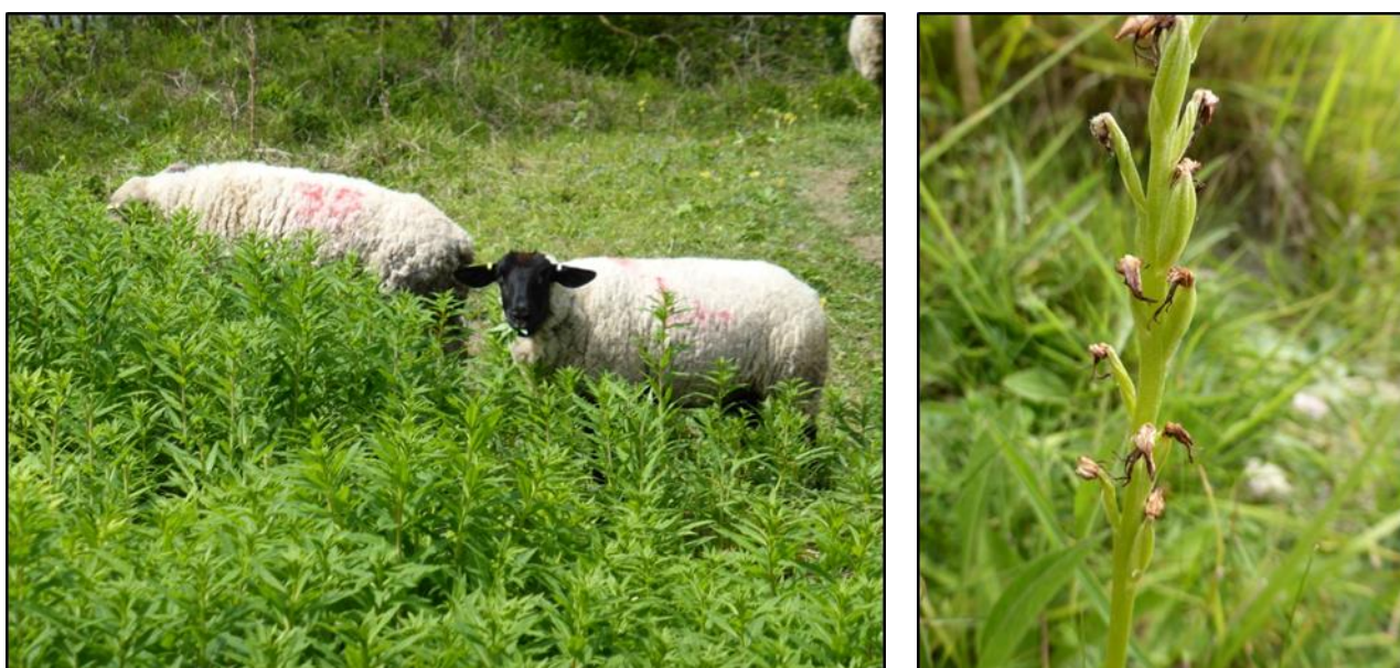
Figure 6 Grazing helps tackling invasive species which would otherwise be detrimental to the reserve (here willowherb); caging or fencing orchids allows them to survive summer grazing without preventing pollination

Another major issue, especially at The Little Hills area, is the increase in rosebay willowherb Chamerion angustifolium and clematis Clematis sp. Summer grazing was desirable to these invasive plants, but not at the expense of the rare plants. Our detailed maps of orchid distribution were used to set up temporary fencing around the key areas for musk and man orchids. With ongoing monitoring, any plants coming up outside these fences were caged. This allowed a high proportion of the orchids to survive the summer grazing, to flower and produce seed.