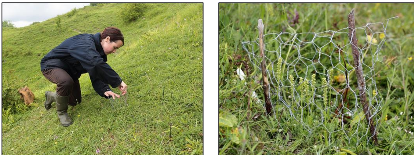
Figure 4 Caging individual or small groups of orchids to protect them from grazing

Fisher's Exact Test (depending on sample size); since Fisher's Exact Test is better suited for contingency tables with small sample sizes.