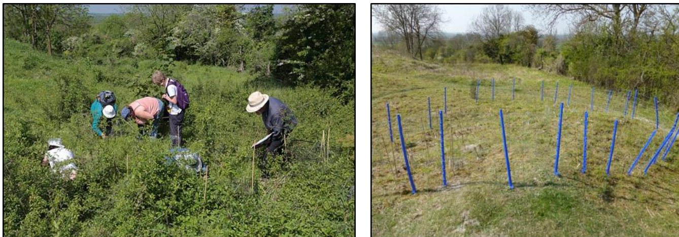
Figure 5 Volunteers surveying man orchids 2014 (left), the same area cleared and fenced in 2015 with canes indicating individual orchids (right)

allows more accurate counts of the number of non-flowering rosettes which were previously hidden under scrub. The increase in numbers of man orchids at Little Hills area between 2014 and 2015 may in part be to the extensive scrub work carried out over winter.