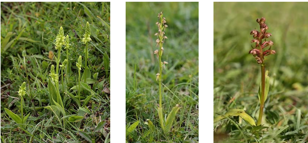
Figure 1 Musk, man and frog orchids at Totternhoe (left to right)

Why do these orchids have such a limited distribution and why have their colonies reduced in size in recent years? For some of these species the opportunity to colonise chalk grassland beginning to establish on disturbed quarry areas may be significant and they don't do well in mature grassland. The abandoned Totternhoe Quarry, only a field away from The Little Hills, has many bare chalk areas that would have been the condition of The Little Hills once quarrying ceased. It is hoped that musk, man and frog orchid can spread into this developing grassland. First we must find out how many plants are left, try to halt further decline and ensure that seed is being produced by the remaining colonies.