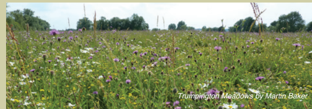
Trumpington Meadows