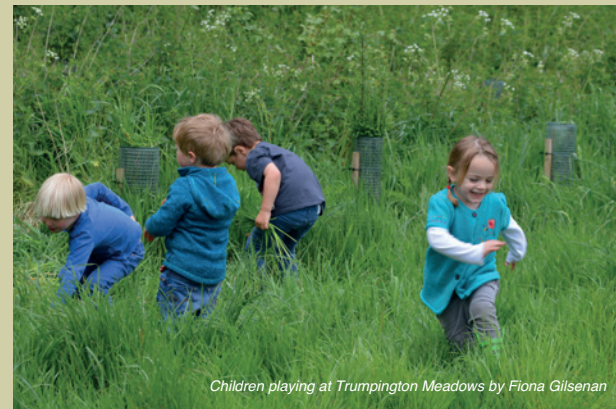
Children playing at Trumpington Meadows by Fiona Giltsenar

These meadows provide ideal habitat for brown hares and farmland birds such as skylarks, meadow pipits and yellowhammers, as well as insects including banded demoiselles and common blue butterflies.