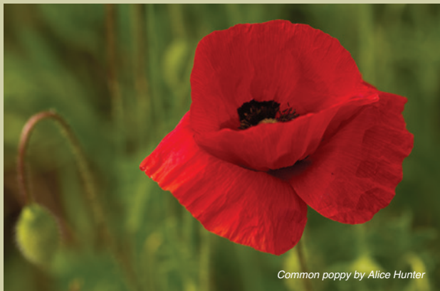
Common poppy by Alice Hunter