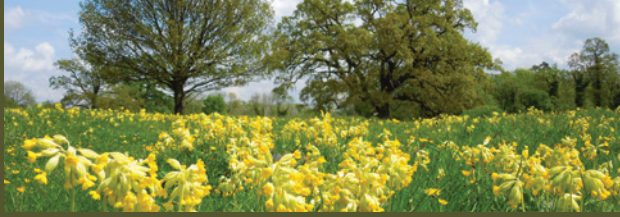
Cowslips at Fulbourn Fen