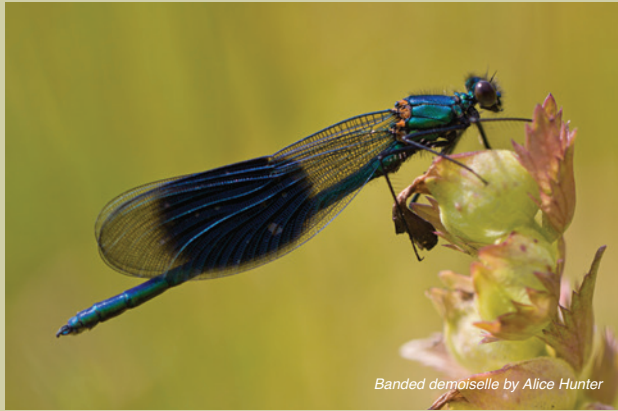
Banded demoiselle by Alice Hunter