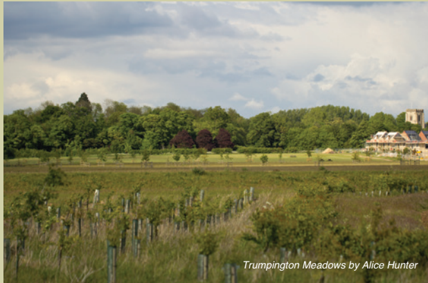
Trumpington Meadows

Bedfordshire Cambridgeshire Northamptonshire