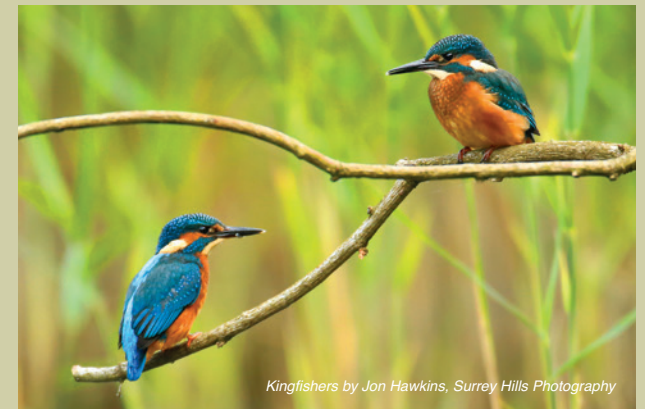
Kingfishers

Neighbouring the reserve is the pleasant woodland and weir at Byron's Pool nature reserve, managed by Cambridge City Council. It is named after the poet Lord Byron who used to swim at the weir pool.