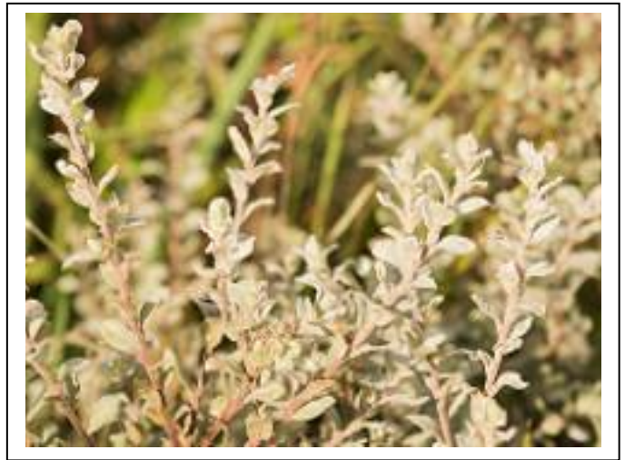
Salix repens , normal form (left) and var. argentea (right)

9 Most leaves at least 5 times as long as broad, with downy hairs or with long silky hairs. 10