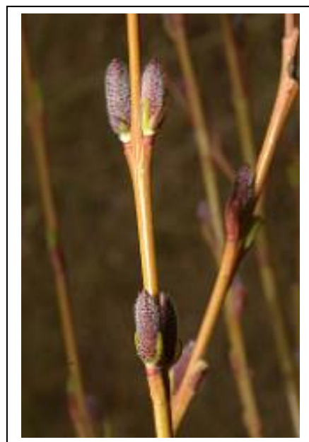
Salix purpurea (leaves and catkins)