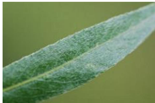
Salix fragilis (left) and S. alba (right)