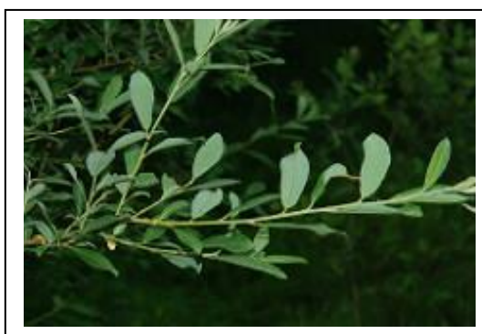
Salix cinerea subsp. oleifolia (left), S. cinerea subsp. cinerea (right)