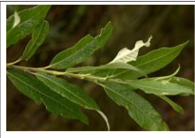
Salix caprea x viminalis (top left)