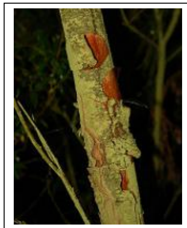
Salix triandra , leaves and peeling bark - for S. fragilis see couplet 2