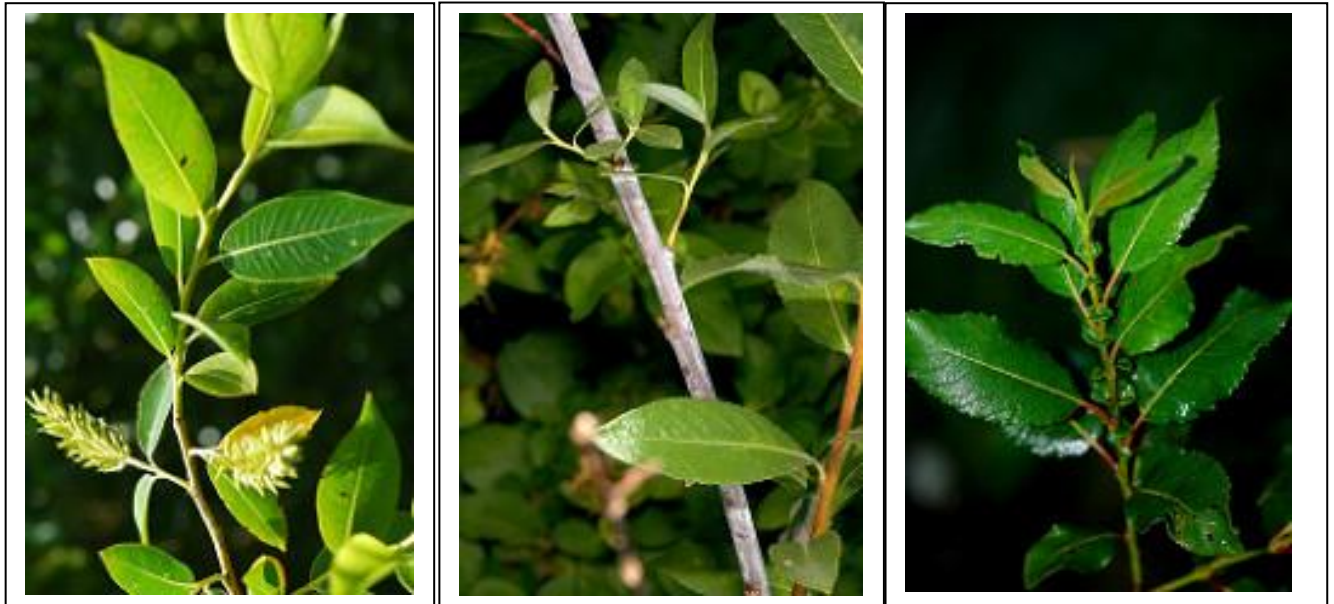
Salix pentandra (left), S. daphnoides (middle), S. myrsinifolia (right)

6 Leaves with straight sides in lower three-quarters, and tapered rather abruptly in apical fifth, 2-8 x 0.5-3cm. Some leaves in opposite pairs along the twigs. Mature leaves dull or silk-finish dark green above, pale bluish green below (eucalyptus coloration), young leaves at tips of branches often orange- or copper-tinged. Leaves turning black when damaged or dried. Bark of twigs brilliant yellow inside.