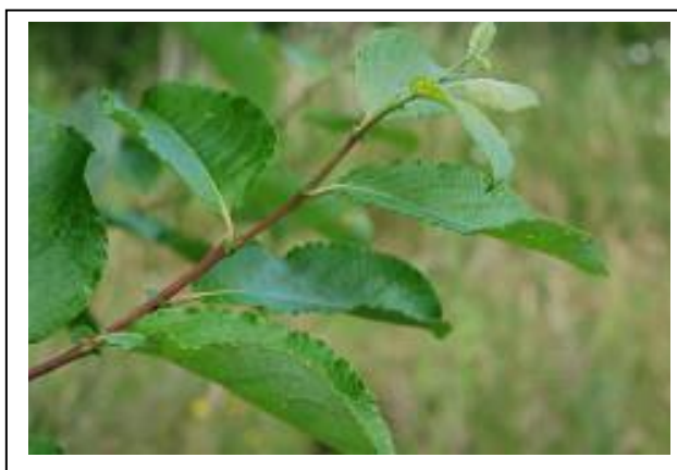
Salix caprea (above)