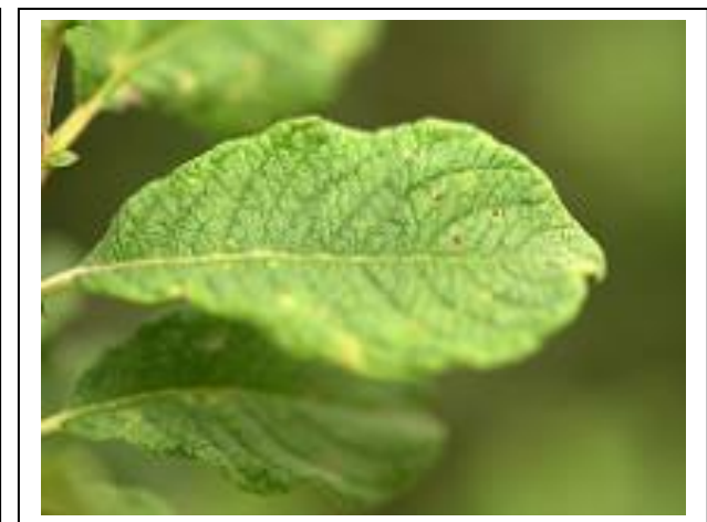
Salix aurita (above)