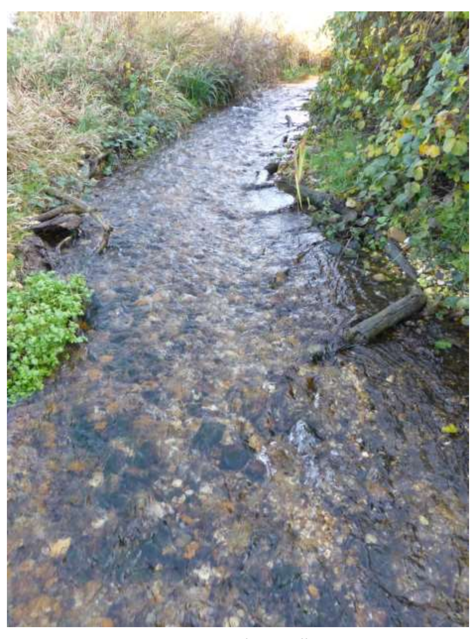
Restored section of the Hoffer Brook