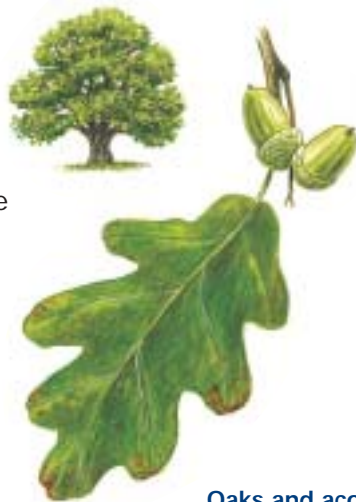
Oaks and acorn

The paths and rides are mown for the benefit of wildflowers