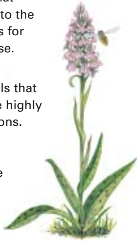
Common spotted orchid

The wildflowers and animals that make this site important are highly dependent on these conditions. With growing numbers of visitors to the site, it is increasingly important to be sensitive to nature, for example simply by cleaning up after dogs and general recreational activities.