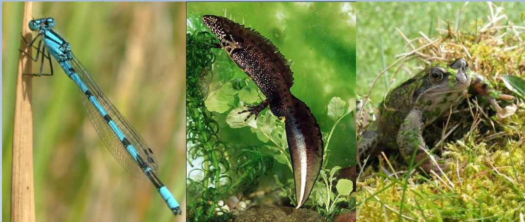
From left to right: Common blue damselfly, great crested newt, and the common frog.