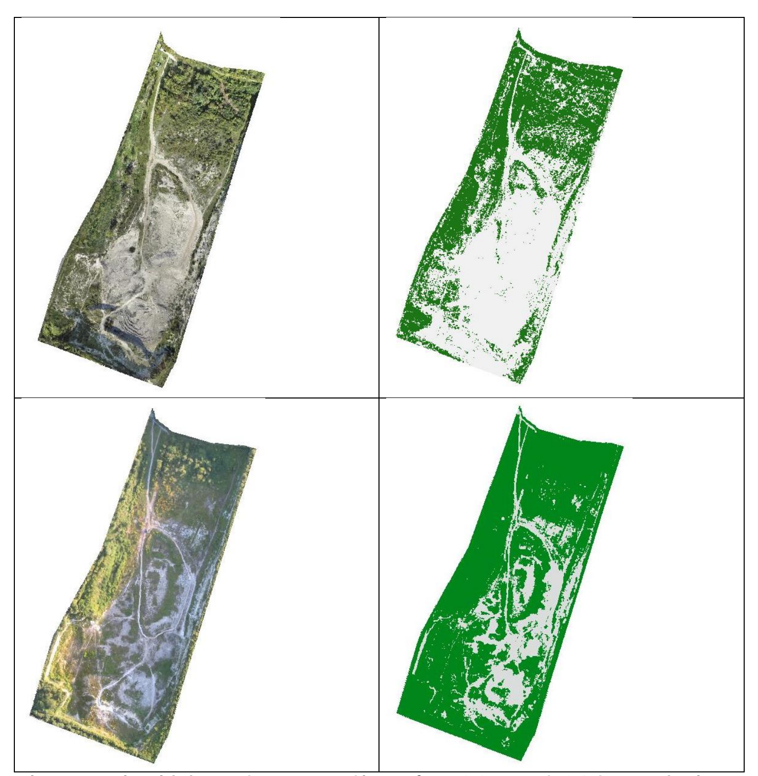
Figure 1 East pit aerial photo and remote sensed images from 2010 (top and 2016 (bottom) showing bare chalk in light grey and vegetation in green.

A visual check of the remote-sensed images suggested that bare chalk was accurately differentiated from vegetated areas (fig 1). The following issues were found with the analysis: