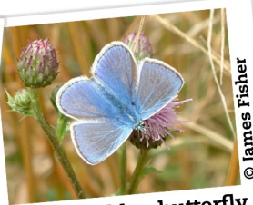
Common blue butterfly