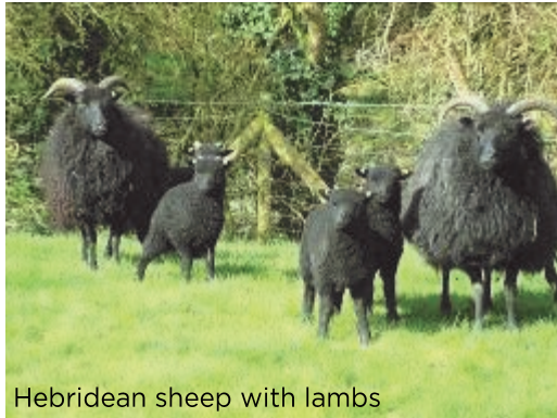
Hebridean sheep with lambs