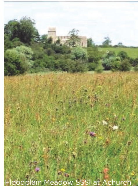
Floodplain Meadow SSSI at Achurch

Floodplain Meadows are part of the quintessential English landscape and would have been common along our river valleys 100 years ago. The land alongside the river has always been susceptible to flooding which brought nutrients to the land leaving no need for additional fertilisation but preventing arable farming. Consequently these fields were alive with wildflowers and attract insects such as butterflies and bees as well as providing breeding sites for ground nesting birds such as curlew.