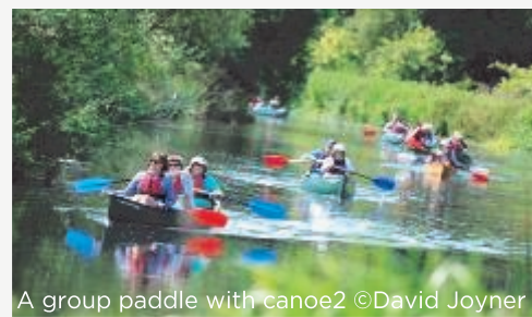
A group paddle with canoe2